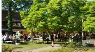
FIG was invited to the International Federation of Housing and Planning, IFHP's Council Summit 2016 on 2 June 2016. High on the agenda was the preparatory work for Habitat III. www.fig.net/news/news_2016/2016_06_ifhp.asp