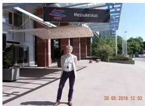
The Conference Centre on a warm June day

The quite abstract logo of the Working Week was designed to illustrate the theme. The colours blue, green, orange, and white symbolise the Finnish nature, its lakes, forests, midnight sun, and snow. The different elements are drawn with brush strokes which together with the colours and shapes create an association with the Finnish landscape paintings dating back to early 1900's. The sun and the forest form a binary one and zero, symbols of digitalisation. This digitalisation is however so advanced that it is no more rectangular and mathematical but describes our analogue world in a way that is more subtle, adaptive, and precise and, thus, offers the people better services.