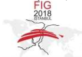
FIG Congress 2018

For additional FIG and FIG Commission events see always up-to-date information at: www.fig.net/events/index.asp