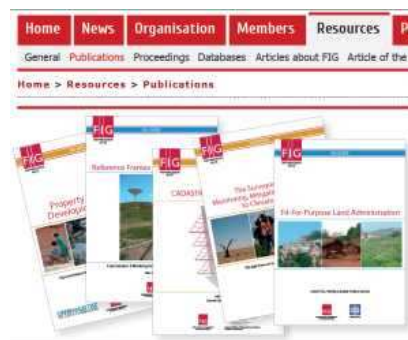
FIG Annual Review 2015:

www.fig.net/resources/proceedings/2016/2016_05_history.asp