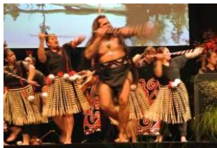
A traditional Maori dance

FIG Working Week 2016 was organised in Christchurch, New Zealand 2-6 May 2016 and attracted more than 700 participants from 65 countries. The Working Week offered a lot of various activities, sessions, pre-workshops and meetings during the busy week.