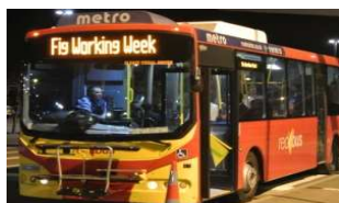
FIG General Assembly 2016 Minutes and Report

The minutes from FIG General Assembly 2016 that took place on 2 and 6 May in Christchurch, New Zealand as part of the FIG Working Week 2016 are now available: